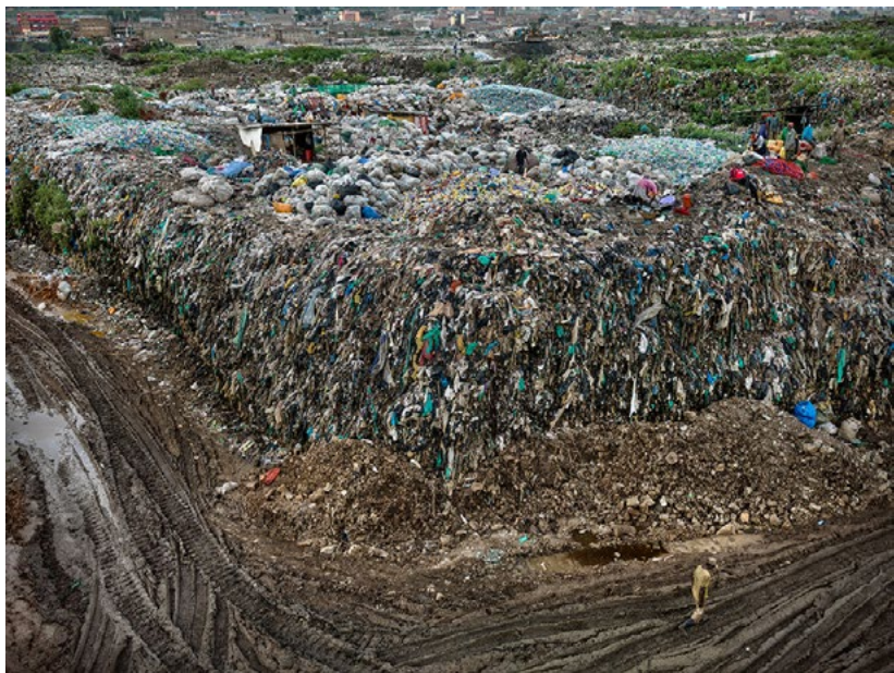
Dandora Landfill #1 Nairobi, Kenya, 2016 Edward Burtynsky