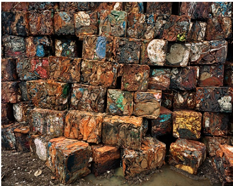
Densified Oil Drums #4 Hamilton, Ontario 1997 Edward Burtynsky